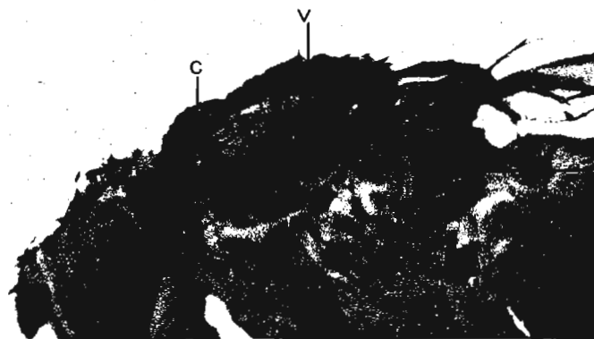
Figure 2 Posterior pit (←) A first vortex (v) and comma (c) are also present.